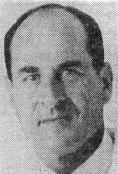
DR. HENRY HEIMLICH

"There's questions of whether he was the originator of the Heimlich